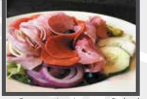
Super Antipasto Salad