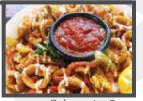
Calamari e Pepe