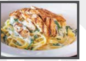
Cajun Chicken & Spinach Alfredo