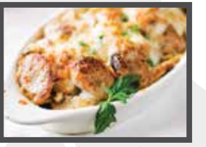
Sausage Mushrooms Ala-Forno