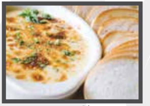
Vinzo's Cheesy Dip