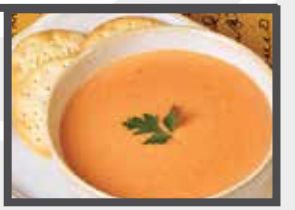
Shrimp & Lobster Bisque

All pasta entrées come with two garlic knots. Add small garden salad or soup 2.50 | Add shrimp and lobster bisque 3.50