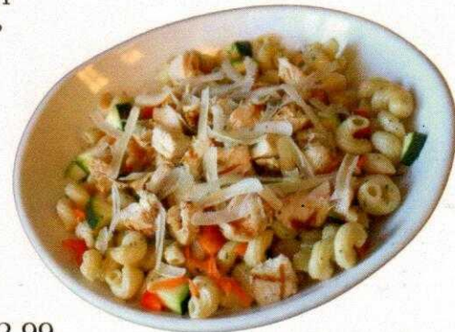
Garlic Chicken Pasta

Tender cavatappi pasta tossed in garlic butter sauce, then topped with julienne vegetables and sassy Cajun grilled chicken. Served with garlic toast. 12.99