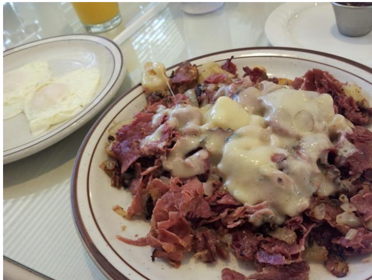
New York Deli Hash w/ Eggs