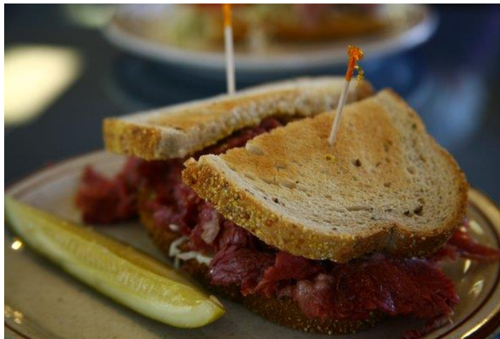
Gunther's Famous Reuben Sandwich