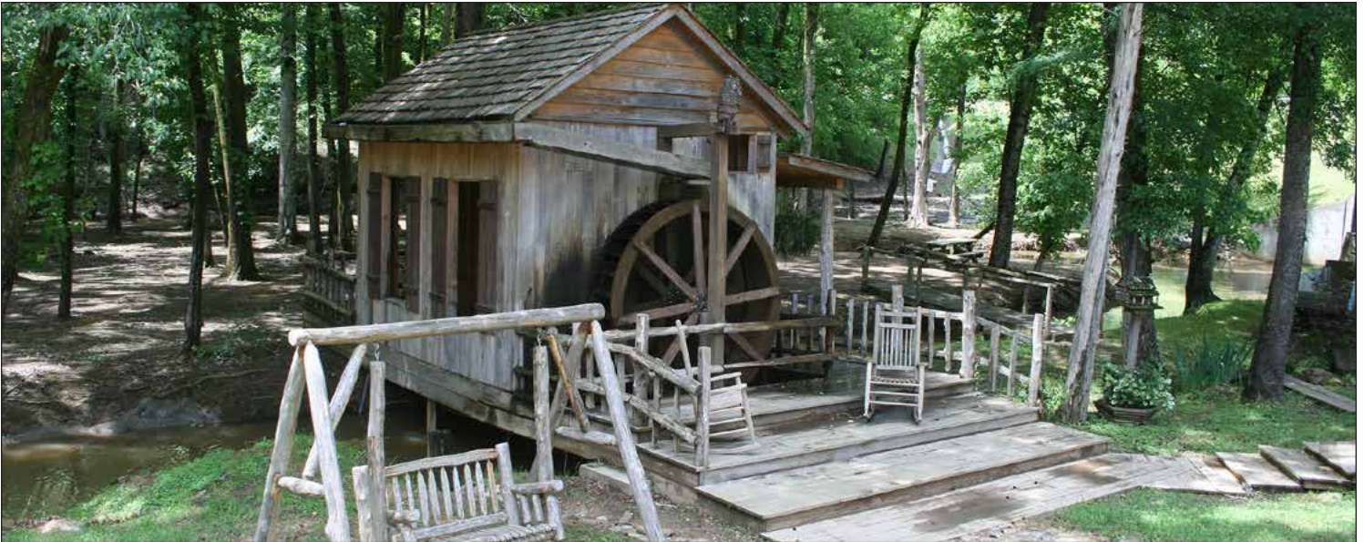
The Gristmill was added at The Outpost for families to have photo opportunities.