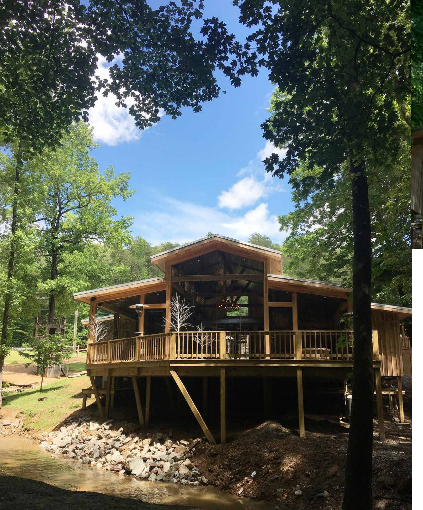
Windsong wedding and event venue at The Outpost features an outdoor deck overlooking a stream and scenic wooded area.