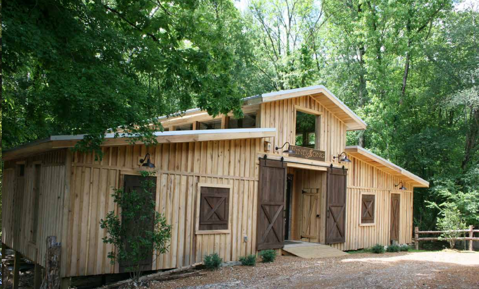
Windsong seats up to 100 people and has a kitchen, restrooms and changing area.