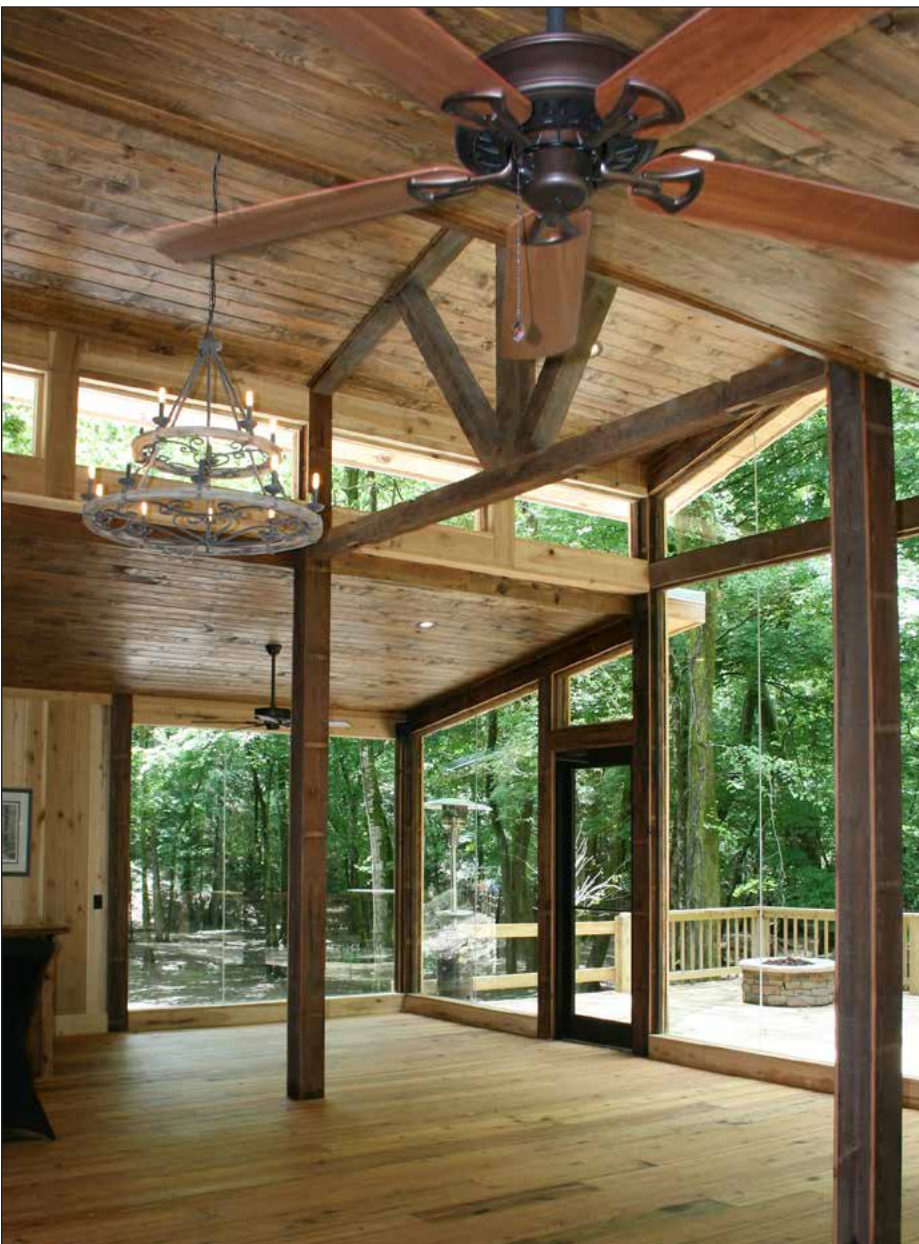
Windsong has floor to ceiling glass walls, flooring from an old cotton gin and wood beams from a horse barn built in 1828.

“The change of seasons are just beautiful,” said the venue composer, looking toward the outdoor deck through the huge windows. “It just takes one’s breathe away – spring, fall and winter. You are one in nature.”